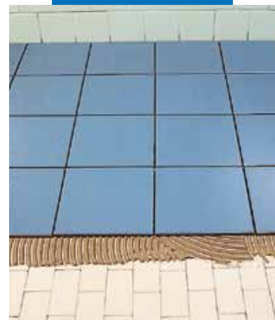
Tile on tile with Keraflex grey