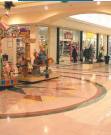
An example of an installation of porcelain tiles - Zanchetta Shopping Centre - Treviso (Italy)