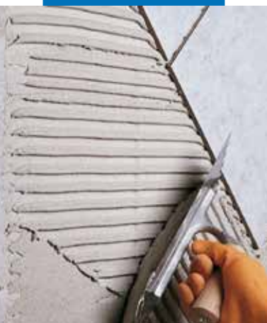
Installation of single-fired tile on expanded foam concrete block walls