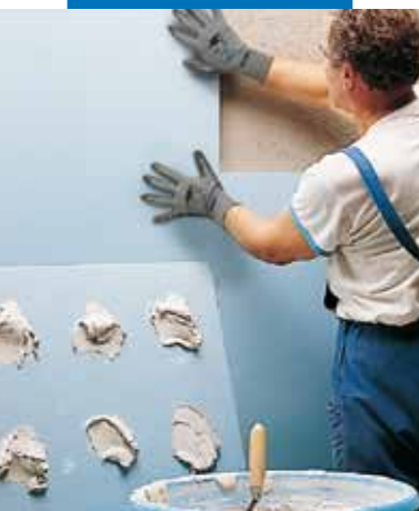
Fixing polystyrene foam slabs with Keraflex white