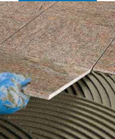
Installation of pre-glossed marble on floors

Floors are set to light foot traffic after approx. 24 hours.