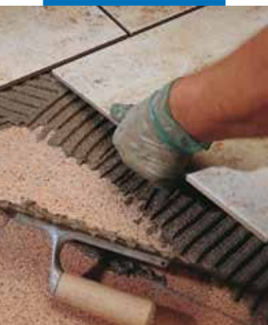
Single-fired tile on terrazzo tile of an external wall