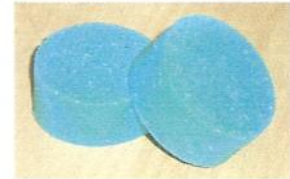
Easy-to-handle, 30 gram Chela Blue Tab