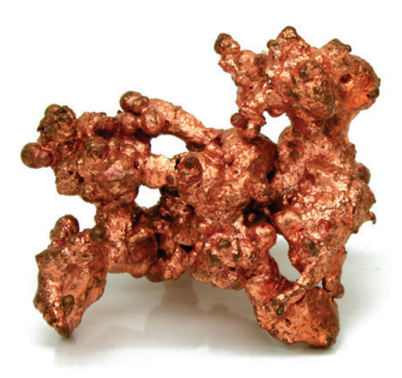
Figure 1: Native copper (~4 cm in size)

It is possible to cast, forge and roll copper. It is noncorrosive under normal conditions and has good water resistant properties. Copper tubes are widely used in the mechanical industry. And copper is also used in ammunition production. Usually copper is utilised in alloys with tin, zinc, nickel etc., which are also used in industry. [3]