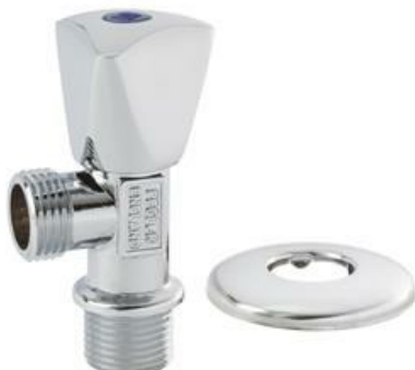
79 Angle valve

Chromium plated brass angle valve, hot or cold, male iron x male iron