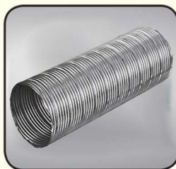
Semi-Rigid Flexible Aluminium Duct