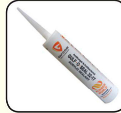
Sealant 32-17 (Acrylic Sealant)