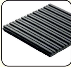
Full Ribbed Rubber Pad