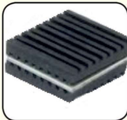
Metal Sandwich Pad