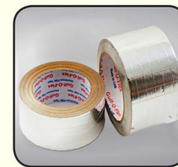
Aluminium FSK Tape