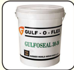
Sealant 30-36 & 30-36 AF (Canvas Coating)