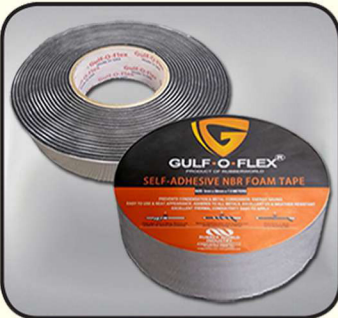
Self-Adhesive NBR Foam Tape