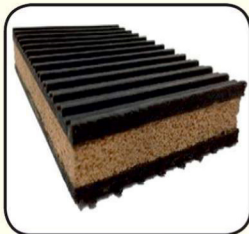
Rubber Cork Pad