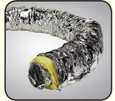
Flexible Insulated Duct