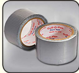
Duct Cloth Tape