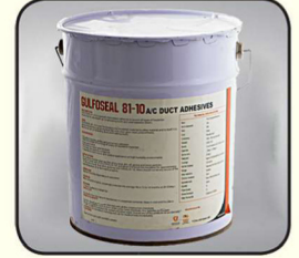
Glue 81-10 (AC Duct Adhesives)