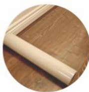
For Furniture & Wood