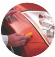
For Finished Surface

Surface Protection Films is designed to prevent surface from scratches, marks during handling, transit, and after installation etc. These films gives excellent scratch resistance and masking properties and thereby coated with non-transfer type specialty adhesive, to withstand abrasions and scratches on smooth and sensitive surfaces. There are no marks/ residue and the paint or finish is not peeled off on removal.