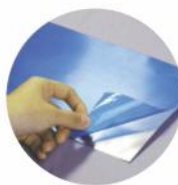
For Steel Sheets & Aluminum