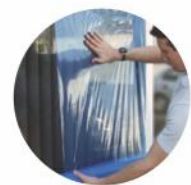
For Glass & Window