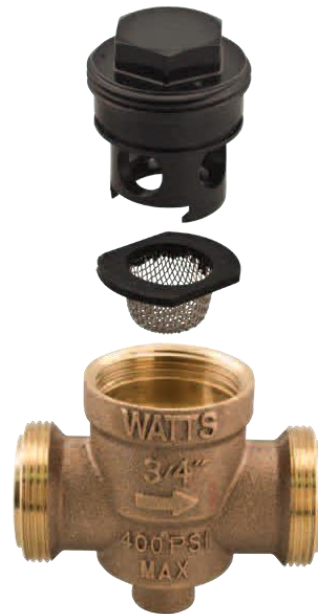
X65B Rough-in Kit