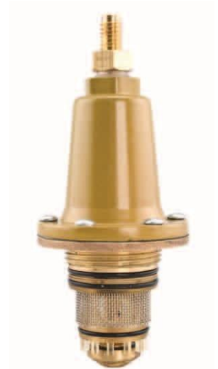
X65B Cartridge Assembly

ALL VALVES PROVIDED WITHOUT CONNECTORS. EXTRA CHARGES FOR CONNECTORS IF REQUIRED