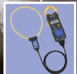
*AC Flexible Current Sensor optional. Also available as part of a value-priced set.