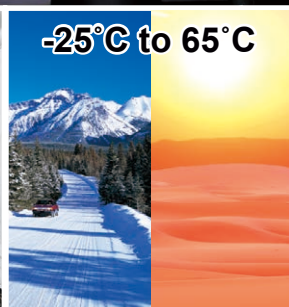
-25°C to 65°C