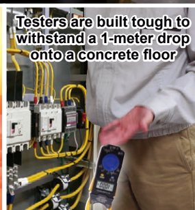
Testers are built tough to withstand a 1-meter drop onto a concrete floor