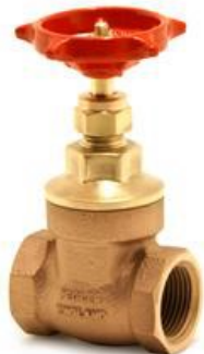
1070/125 Gate valve